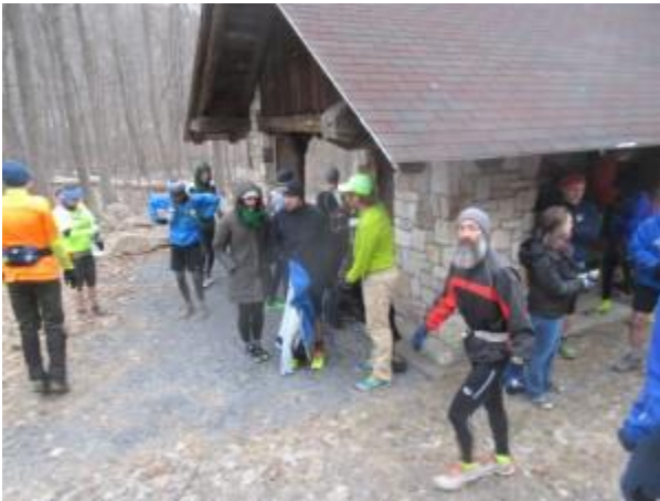
The starting area

On March 28, 40 runners arrived at Big Spring Picnic Area, in the far western Perry County, PA. to run the Harrisburg Area Road Runners Club's Tuscarora Trails Ultra 50K. This is a free event, but all runners must register in advance and are required to bring a donation for the aid stations.