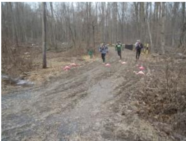
The speedsters hitting a flock of flamingos

Clayton Boucher, last year's defending champ returned, along with several other speedsters.